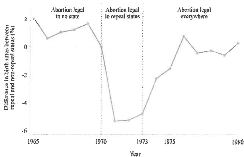
Figure 1: Trends in birth rates in repeal states relative to the rest of the country

32. Then after Roe v. Wade made abortion legal in the other states, their birth rates fell relative to the repeal states, such that repeal-states-minus-other-states difference that emerged from 1971-1973 had vanished by 1976. As such, the second natural experiment indicates that making abortion legal in the rest of the United States decreased birth rates in those states. Alternatively, the evidence can be thought of as indicating that birth rates are increased if abortion is illegal.